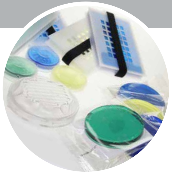
> Our gels