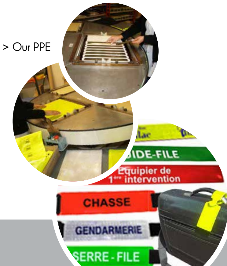
> Our PPE